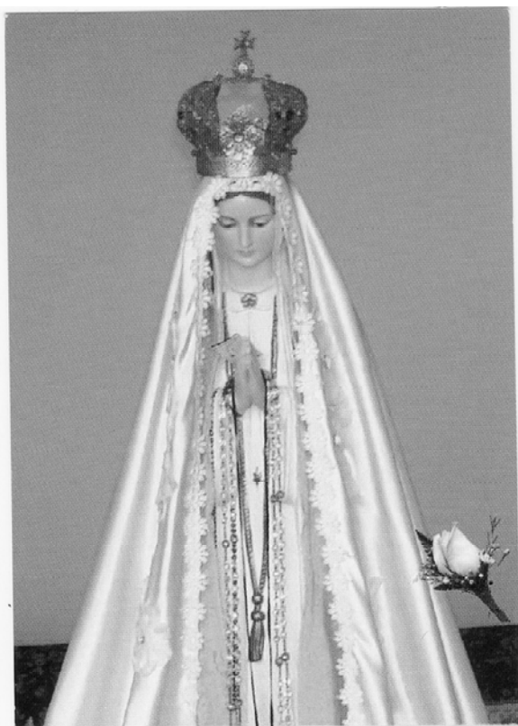
Queen of the Knights, pray for us!

Our Lady, Queen of the Knights, bless all the activities of our Order. Keep us true to our pledge to extend the Kingship of your Divine Son on earth. Through your intercession, win for us the grace, ever to exemplify in our public and private lives the virtues which should characterize those specially dedicated to the service of the heavenly court. Make us always aware that, as your Knights, our actions are constantly observed, our faith measured, and our Order judged. Accept, O Mary, this renewed pledge of fealty and devotion from us, your servants, the Knights of Columbus.